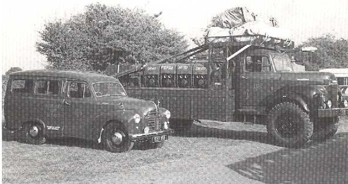
Commer 'Bikini' Unit SKF 509 alongside an Austin A40 AFS staff car.

This particular machine is owned by Leicester City Fire Brigade Society but is on long term loan to the Fire Services National Museum Trust. It is believed that this appliance is one of only three surviving to this day and in private hands. It is certainly one of two which are fully kitted up.