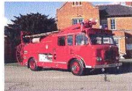
One of the restored appliances outside the Trust's Office