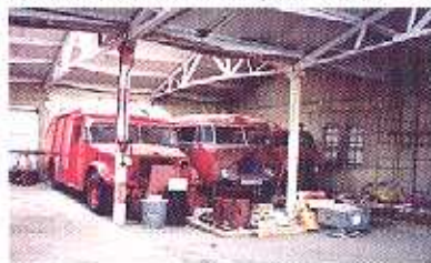
Waiting for the bells!

Now is the time for all established 'Friends' and new 'Friends' to consider how we help the Museum rapidly become a major force in education, fun and spectacle for all to enjoy. We will need to provide continuing practical support in working parties, of course. But we also need to have particular regard for other types of support, for example, staffing of exhibits, consideration to marketing, the opening