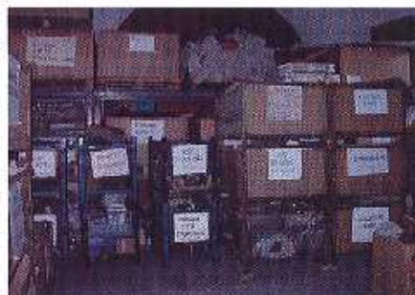
Part of the vast collection in storage

As you can see from the Chairman of the Trustees report inside the pages of this News sheet, the Museum is now taking shape and providing working parties with considerable work in ensuring when it opens its doors for the first time next year, it is an exciting place to visit for enthusiasts and general members of the public alike.