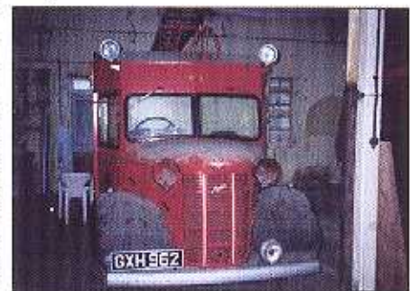
Appliance awaiting a final polish for display